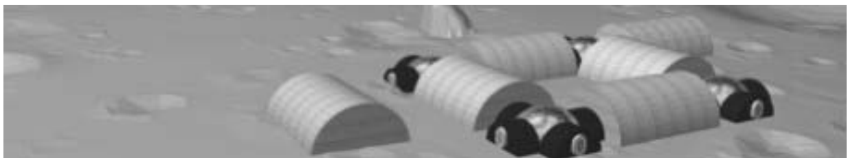
Abb.1: Blue Moon Base with a square configuration. Stuttgart Universität SSDW 2009

In the context of a PhD study on “Habitability for Outer Space” at the TU-Berlin Human-Machine System Dept., colours, shapes and movements are the visual stimuli involved in a Human Factors investigation aimed to increase the habitability of space habitat.